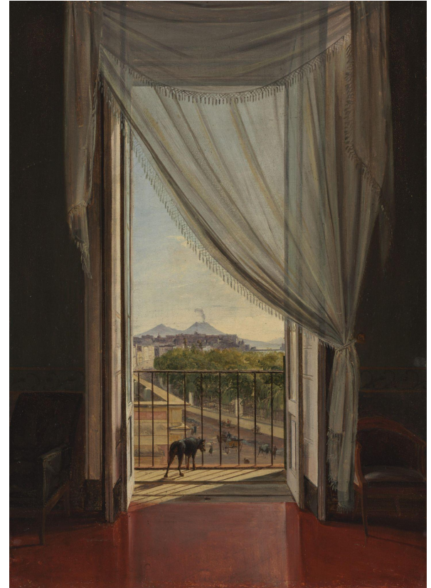
Franz Ludwig Catel (German, 1778-1856) 1824.

Path to Open is building a roadmap to open access for scholarly books. Shaped through discussions with book publishers, library leaders, and scholars, this new community-supported program will provide libraries with affordable access to diverse, high-quality frontlist book titles, support sustainable university press publishing in the humanities and social sciences, help authors reach a global audience, and advance equity of access to underserved researchers and readers around the world.