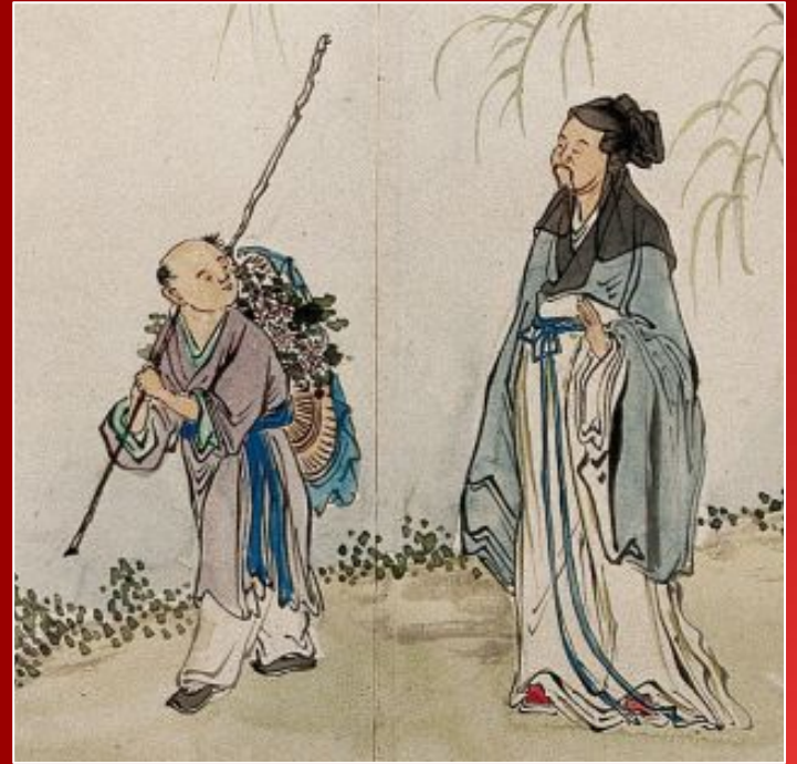
A Chinese sage, in conversation with a traveller on the road. Gouache by a Chinese artist, ca. 1850.